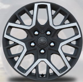
WPA - 18-Inch Machined Painted Grey Wheels (Standard on Overland)