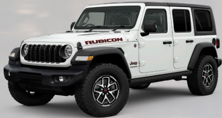
PW7 - Bright White (Standard)