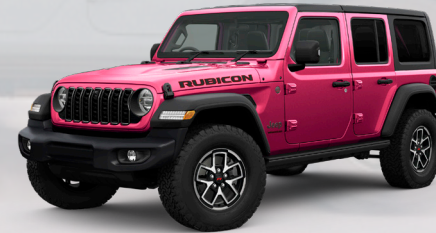
PHP- Tuscadero (Option) From March 2024 production