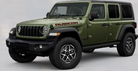
PGG - Sarge (Option)