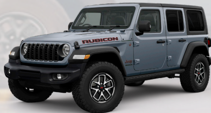
PDS - Anvil (Option)