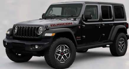
PX8 - Black (Option)