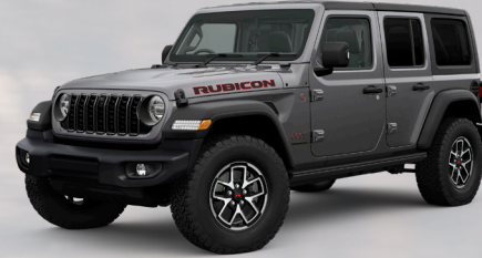
PAU - Granite Crystal (Option)