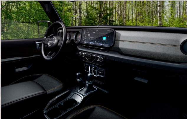
E7X9 - Black Cloth (Standard - Sport S)

Option (O) Standard (S) Not Available (-)