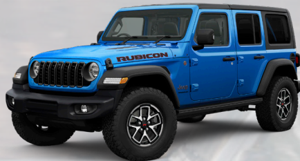
PBJ - Hydro Blue (Option)