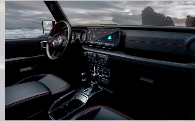
VLX9 - Black Nappa Leather Trimmed Bucket Seats (Standard - Rubicon)