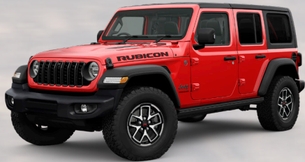
PRC - Firecracker Red (Option)