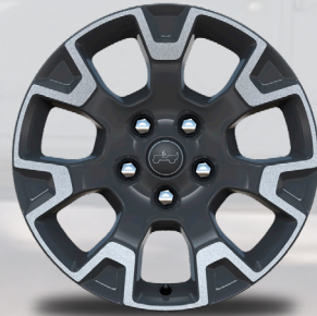
WPD - 18-Inch Machined Painted Grey Wheels (Optional on Overland) (Available until March 2024 production)