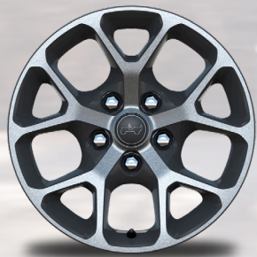
WFH 17-Inch Machined Wheels with Black Pockets (Standard on Sport S)