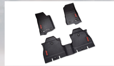
All Weather Mats