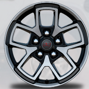
WFV - 17-Inch Machined Painted Black Wheels (Standard on Rubicon)