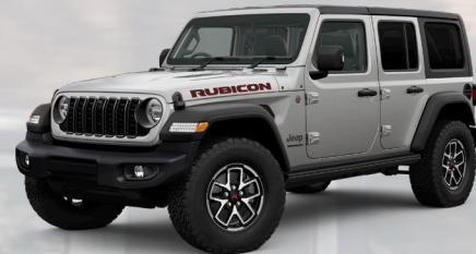
PSE - Silver Zynith (Option)