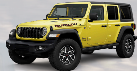
PJF - High Velocity (Option)