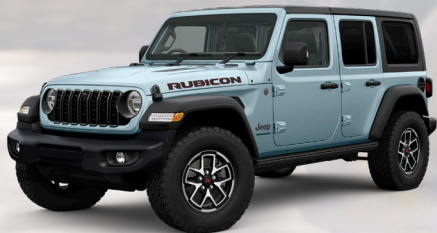
PGP - Earl (Option)