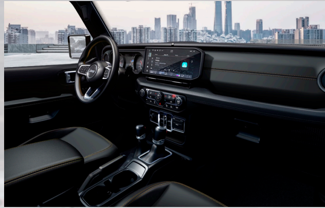
BPX9/NLX9 - Black McKinley Premium (Standard - Overland)