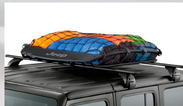
Roof Rack Kit