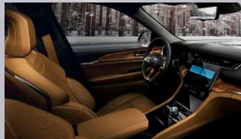
ECT7 - Tupelo Palermo Leather-trim (Option - Summit Reserve)