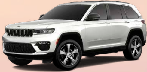
PW7 - Bright White (Standard)