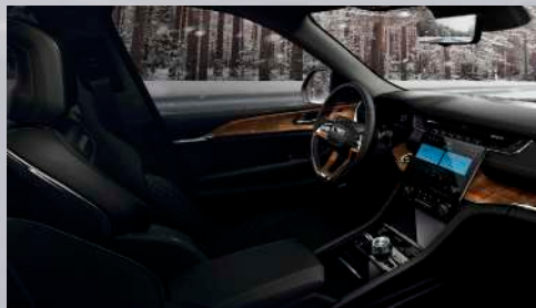
ECX7 - Black Palermo Leather-trim (Standard - Summit Reserve)