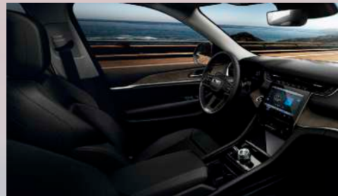
D6X7 - TechnoLeather trim (Standard - Limited)