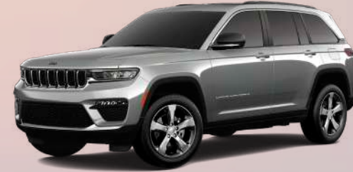
PSE - Silver Zynith (Option)