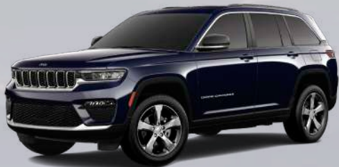
PCQ - Midnight Sky (Option)