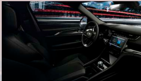
DZX7 - Black Suede & TechnoLeather - accented trim (Standard - Night Eagle)