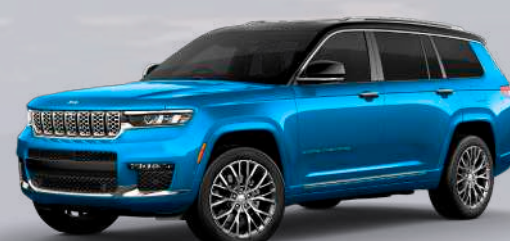
PBJ - Hydro Blue (Option)