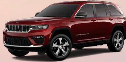
PRV - Velvet Red (Option)