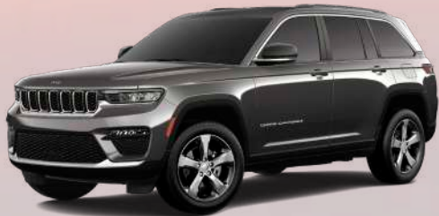
PAS - Baltic Grey (Option)