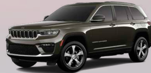
PFJ - Rocky Mountain (Option)