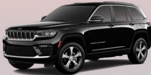
PXJ - Diamond Black (Option)