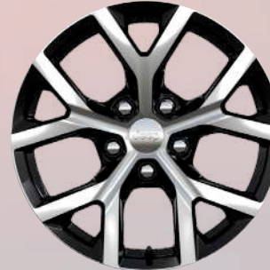
WLH - 18-inch Full Polished / Painted Alloy Wheels (Optional on Overland)