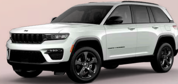
5 seat Night Eagle