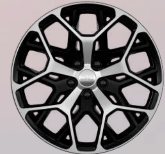
WJA - 21-inch Machined / Painted Alloy Wheels (Standard on Summit Reserve 4xe)