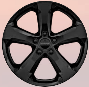
WHF - 20-inch Gloss Black Painted Alloy Wheels (Standard on Night Eagle Optional on Limited)