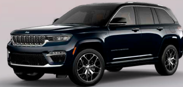
5 seat Summit Reserve 4xe