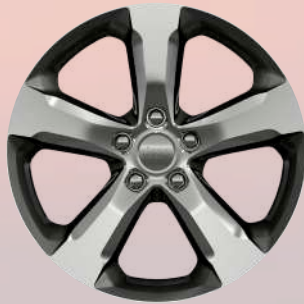
WHG - 20-inch Machined / Painted Alloy Wheels (Standard on Limited)