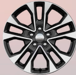
WLJ - 20-inch Full Polished Alloy Wheels (Standard on Overland)