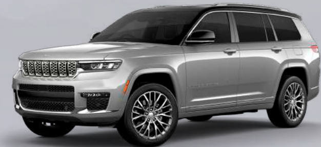
7 seat Summit Reserve