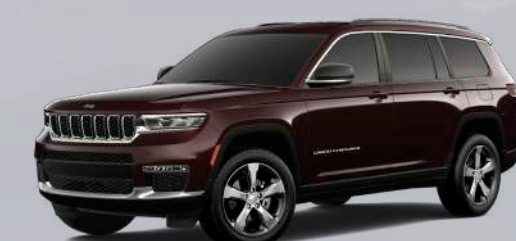
PHC - Ember (Option - 7 seat only)