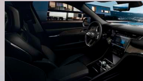
BLX7/TLX7 - Black Nappa Leather-trim (Standard - Overland)