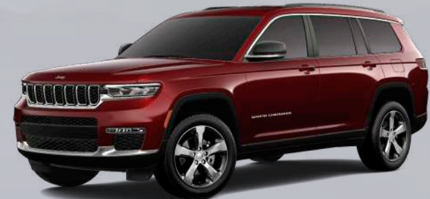
7 seat Limited