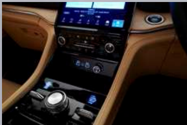
Electric Brake Controller