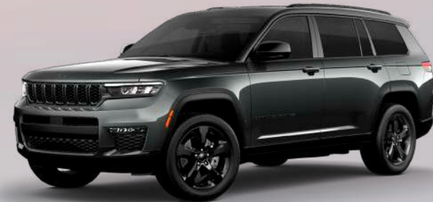
7 seat Night Eagle