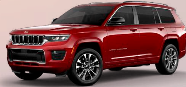
7 seat Overland