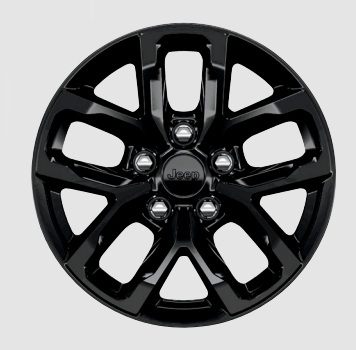
WFP - 17-inch Black Alloy Wheels (Standard on Night Eagle)

Option (O) Standard (S) Not Available (-) Not Available With (NAW)