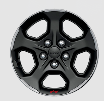
WFJ - 17-Inch Granite Crystal Alloy Wheels (Standard on Rubicon)