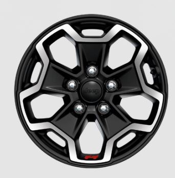
WFN - 17-inch Polished Black Alloy Wheels (Option on Rubicon)