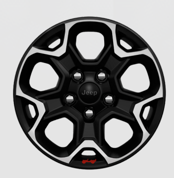
WGQ - 17-inch Machined Black Painted Wheels (Option on Rubicon - Late Availability)