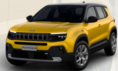
Sun with Volcano Roof (PYP/MXS)