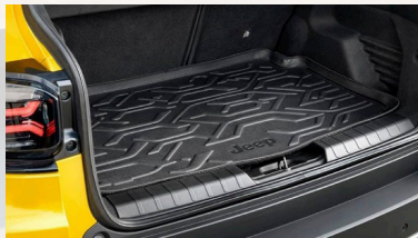
Cargo Mat – Reversible

When it comes to your Jeep vehicle, not all parts are created equal. All Genuine Jeep accessories fitted at purchase are covered by the same 5-year/100,000km warranty* applied to your Jeep. This means you can personalise your vehicle with complete confidence.