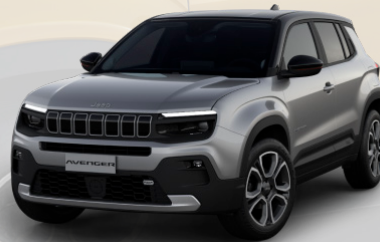
Granite with Volcano Roof (PBN/MXS)