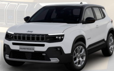
Snow with Volcano Roof (PW3/MXS)