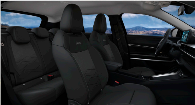
Cloth Black & Grey seats with TechnoLeather Bolsters (5P2)