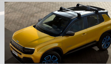
Roof Cross Bars

*Which occurs first. ^Please see Jeep.com.au ~When you service with Jeep