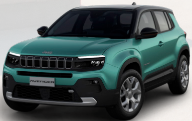
Lake with Volcano Roof (PC1/MXS)