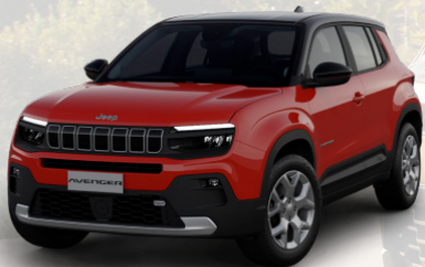
Ruby with Volcano Roof (PR1/MXS)