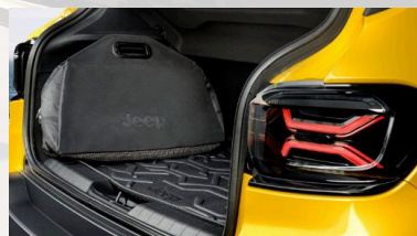
Charging Cable Bag