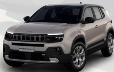
Stone with Volcano Roof (PD1/MXS)