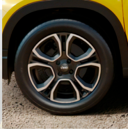
18-Inch Diamond Cut Alloy Wheel (1M5)