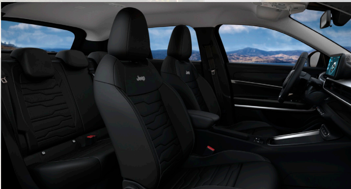
Black Leather Accented Seats with Grey Stitching (5P1)