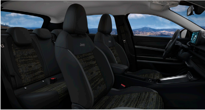
Digital Jane with Black Fabric Bolster (5P0)