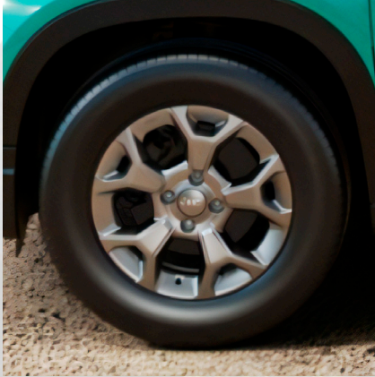
17-Inch Alloy Wheel (1M3)

Option (O) Standard (●) Not Available (-)